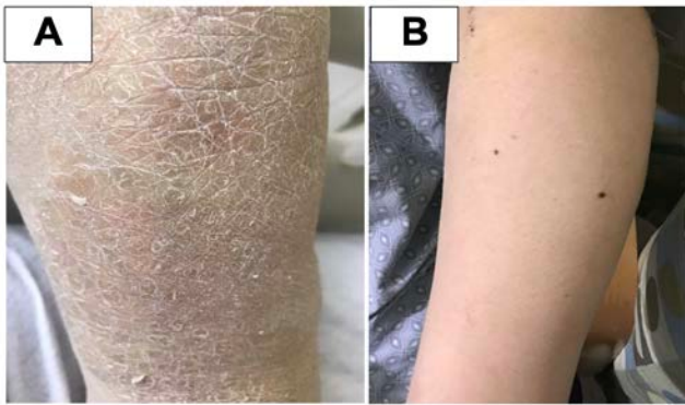
Figure 3: Patient's skin findings on day of admission (A) in comparison to time of discharge with notable improvement in dryness of skin (B).