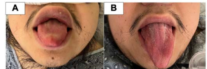
Figure 2: Patient demonstrating macroglossia on hospital day 5 (A) compared to notable improvement on hospital day 11 (B).