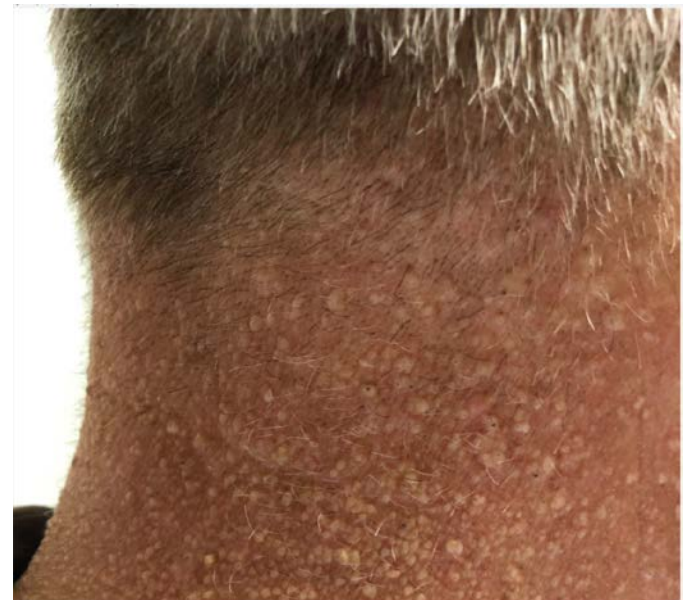
Figure 1: Small white dome shaped papules over posterior neck consistent with fibrofolliculomas