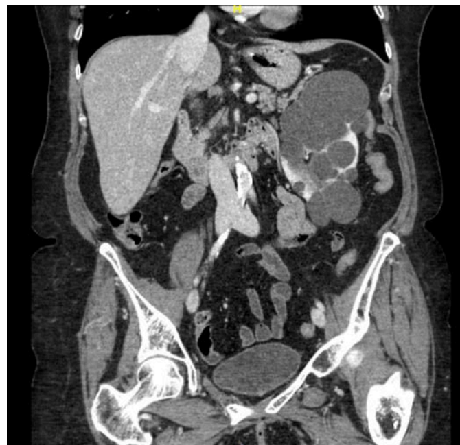
Figure 1: Coronal CT image demonstrating left kidney with multiple cysts involving the entire kidney and enlarged appearance.

Her basic metabolic panel was within normal limits with a BUN 12 and creatinine of 0.80. Her TSH, complete blood cell count, and vitamin D levels were within normal limits as well. Computed tomography (CT) of abdomen/pelvis was obtained (Figures 1-3).