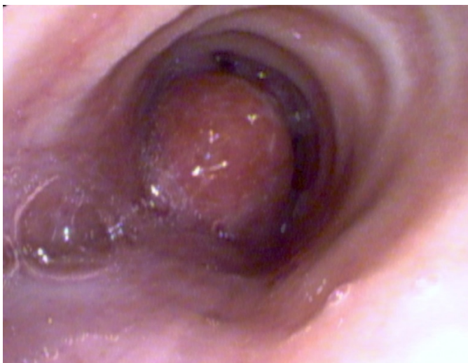
Figure 2. Bronchoscopic image of Glomus Tumor arising from posterior membranous tracheal wall.